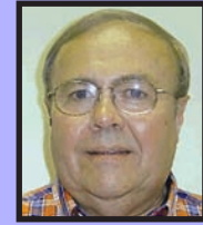
Vice-Mayor Karl Littman Precinct 4