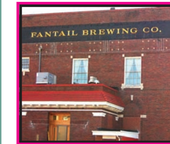
Fantail Brewing Company from the North.

restaurant pays tribute to the building's historic past by uncovering the original brick and hardwood floors and refurbishing the exterior. In keeping with their theme, they see the restaurant as a place with a relaxed atmosphere. They plan to initially use two floors of the building, with the basement providing a recreation area for kids and adults and a space for parties, while the main floor serves as the more formal dining space.